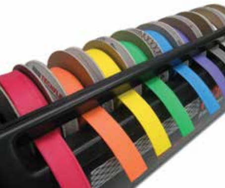
Shrinkflex shop spools fit into our dispenser kit (pg. 101) for easy storage and organization.

When economy is priority, 2:1 Shrinkflex heatshrink tubing is the answer. Not as versatile as a high ratio shrink product, 2:1 will still slide easily over small inline splices and connectors and provide a tight seal in many applications.